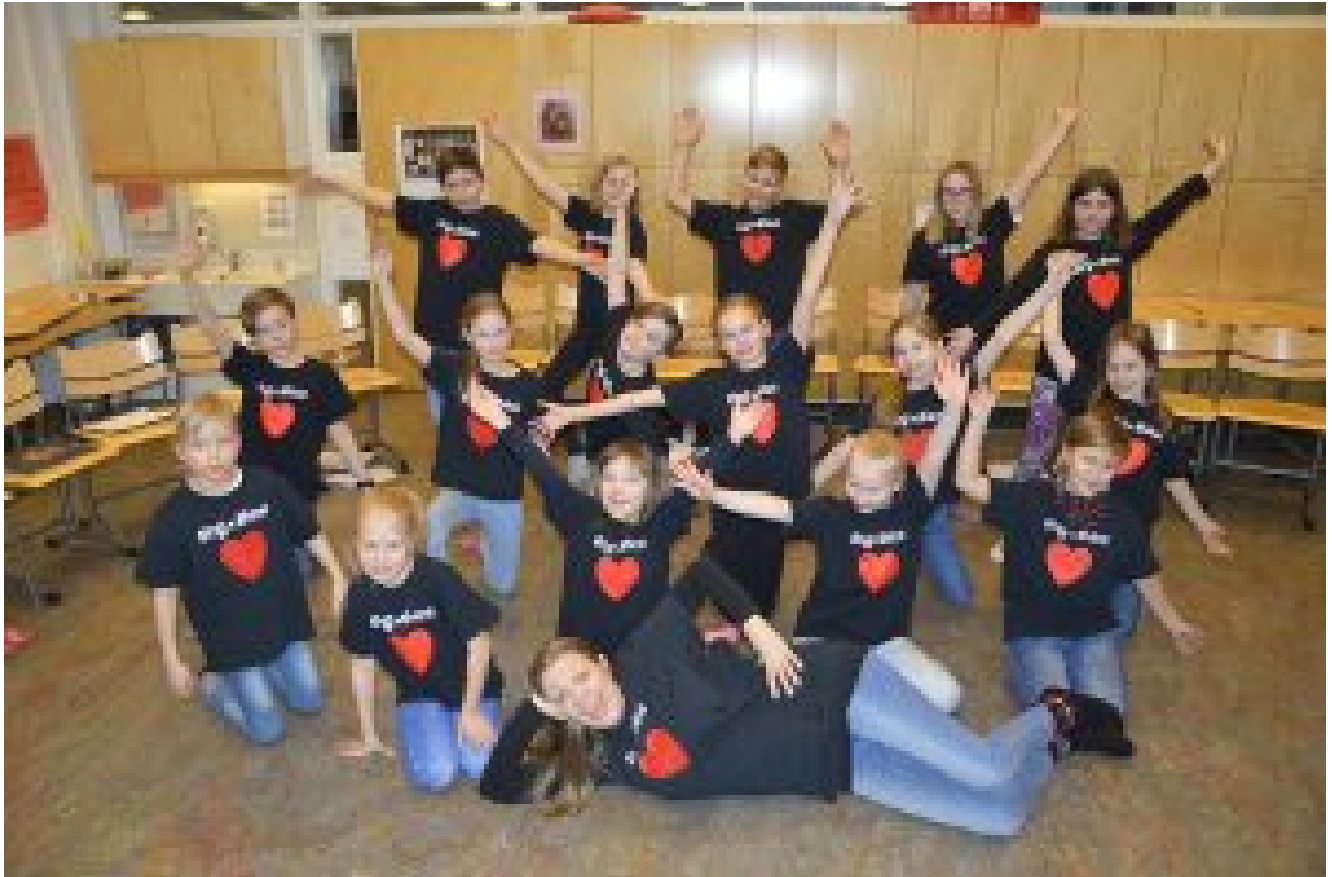
Rehearsals, March 2019, Westendipuiston school, Espoo, Finland