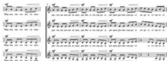
Figure 12. Tóth, "Magnus, maior, maximus," m. 3-7

(Click on the image to download the full score)