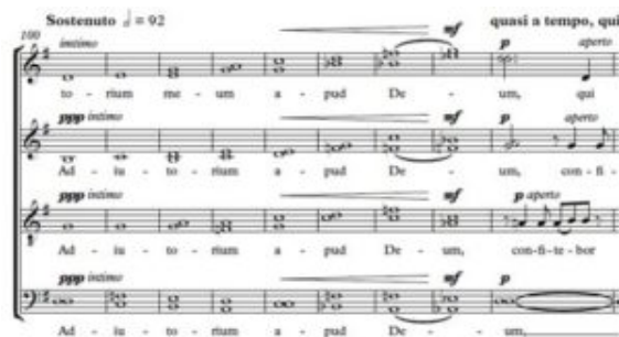
Figure 11. Gyöngyösi, “Domine Deus meus,” m. 100-108

(Click on the image to download the full score)