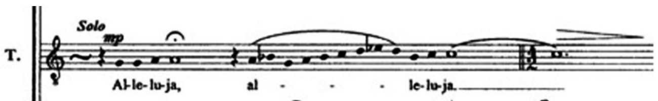
Figure 1. Karai, "Alleluia", m. 1

(Click on the image to download the full score)