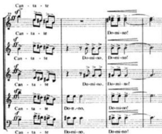
Figure 5. Szokolay, "Cantate Domino," m. 22-25

(Click on the image to download the full score)