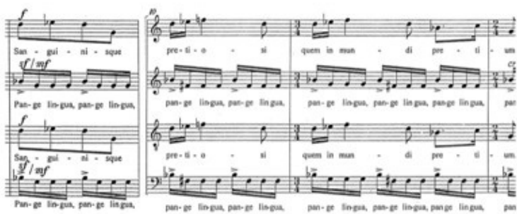
Figure 7. Orban, "Pange lingua," m. 9-12

(Click on the image to download the full score)