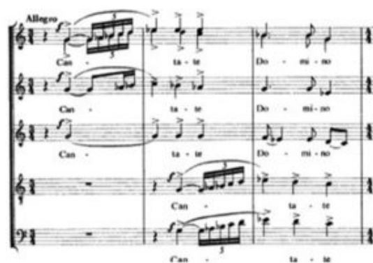
Figure 4. Szokolay, "Cantate Domino," m. 1-3

(Click on the image to download the full score)