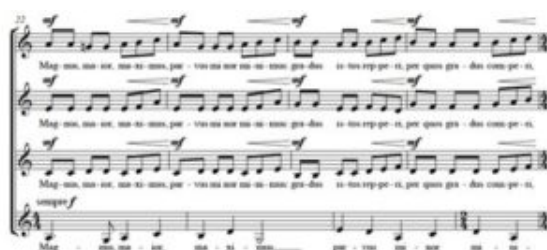
Figure 13. Tóth, "Magnus, maior, maximus," m. 22-25

(Click on the image to download the full score)