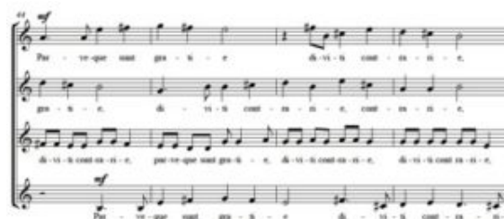
Figure 14. Tóth, "Magnus, maior, maximus," m. 44-47

(Click on the image to download the full score)