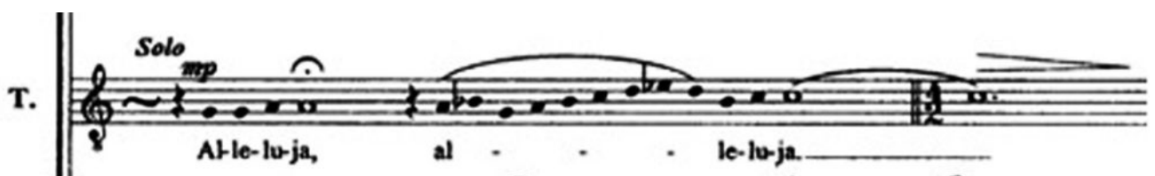
Figure 1. Karai, "Alleluia", m. 1

(Click on the image to download the full score)