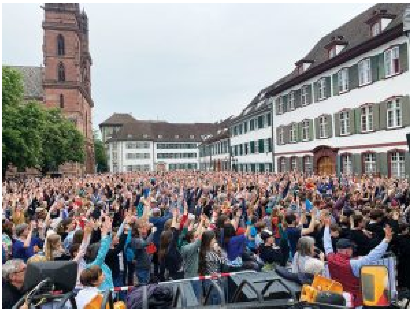
Body Percussion

who participated. Beyond the captivating performances and musical growth, the festival provided a space for cultural exchange, personal development, and lifelong connections.