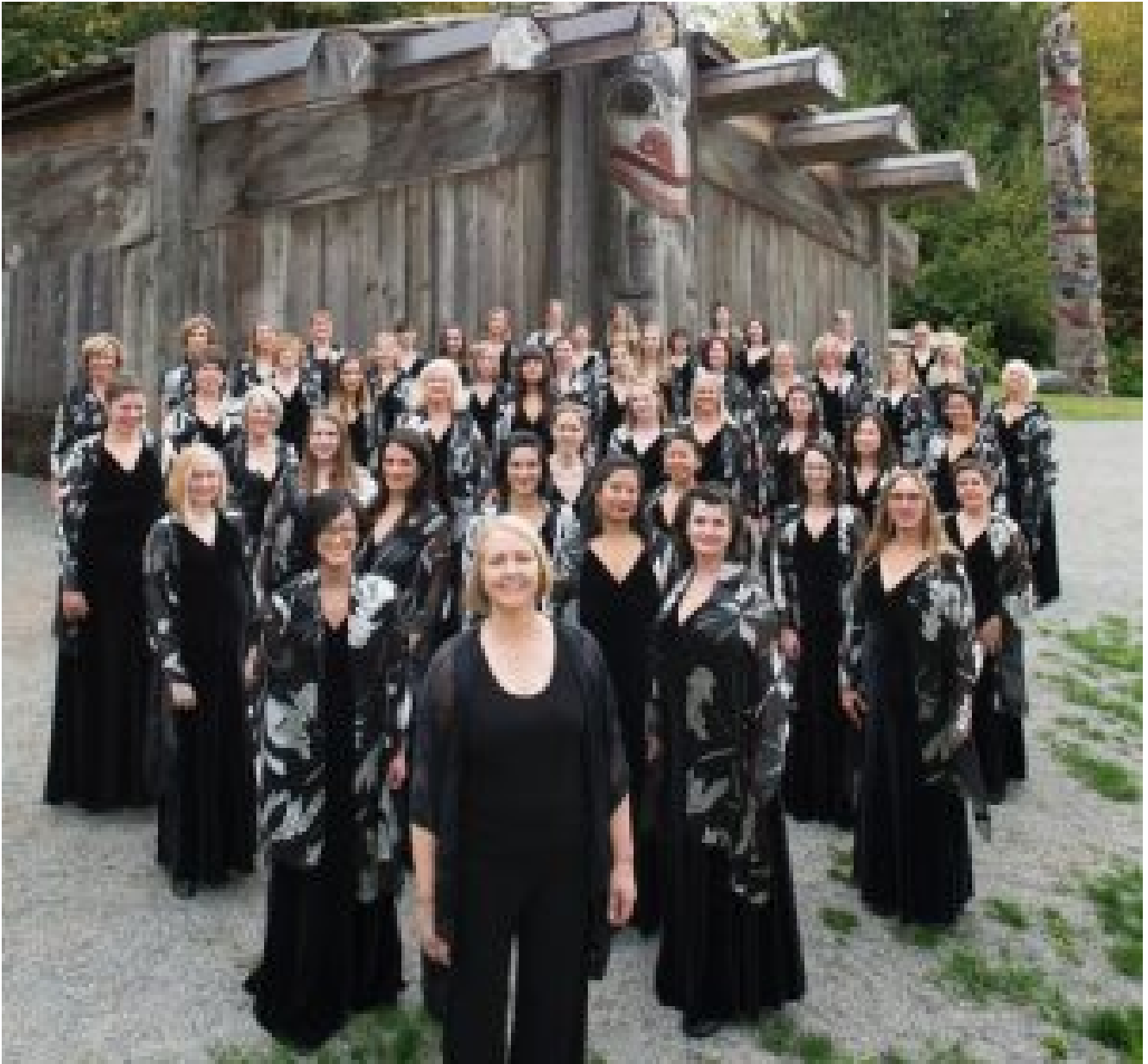
Elektra Women's Choir