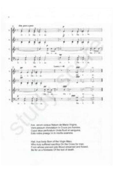
Ave Verum Corpus – Image 3