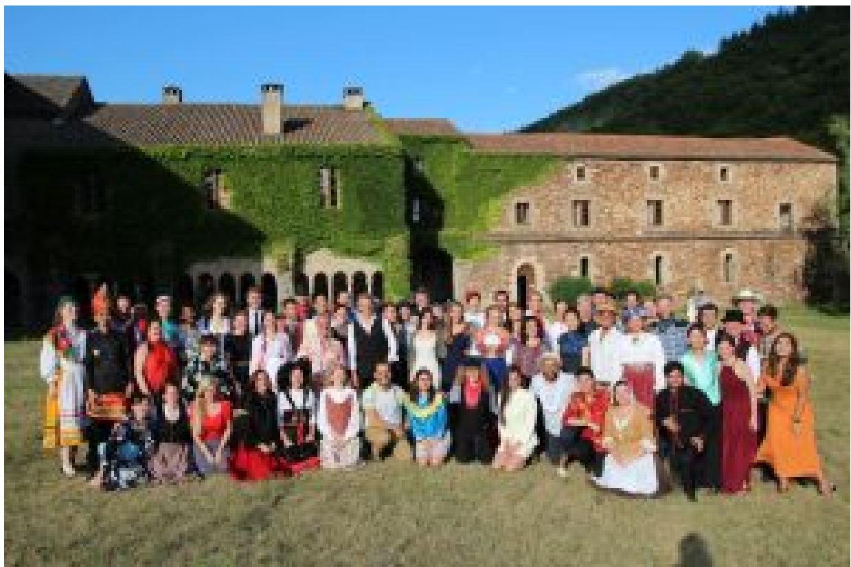
The World Youth Choir singers in traditional clothing, showcasing the cultural richness of their 29 different

Based in Bonn, the National Youth Orchestra of Germany (BJO) is Germany's youngest major orchestra. Founded by the German Music Council (Deutscher Musikrat) in 1969, the BJO is composed of the country's finest young musicians between the ages of 14 and 19. In addition to Sir Simon Rattle, BJO Conductor of Honour since 2018, the orchestra has been directed by renowned conductors such as Herbert von Karajan, Kurt Masur, Gustavo Dudamel and Kirill Petrenko. In 2013 the Berlin Philharmonic Orchestra assumed the role of patron orchestra to the BJO and mentors it through joint rehearsals, masterclasses and concerts.