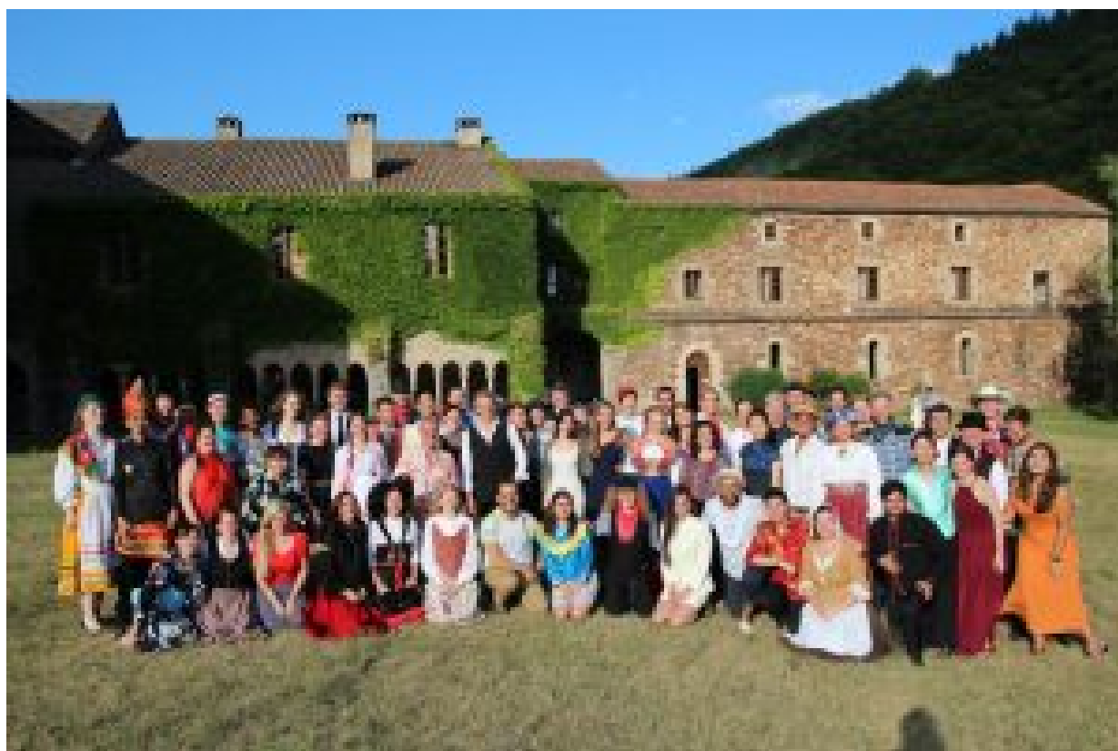
The World Youth Choir singers in traditional clothing, showcasing the cultural richness of their 29 different

Based in Bonn, the National Youth Orchestra of Germany (BJO) is Germany's youngest major orchestra. Founded by the German Music Council (Deutscher Musikrat) in 1969, the BJO is composed of the country's finest young musicians between the ages of 14 and 19. In addition to Sir Simon Rattle, BJO Conductor of Honour since 2018, the orchestra has been directed by renowned conductors such as Herbert von Karajan, Kurt Masur, Gustavo Dudamel and Kirill Petrenko. In 2013 the Berlin Philharmonic Orchestra assumed the role of patron orchestra to the BJO and mentors it through joint rehearsals, masterclasses and concerts.