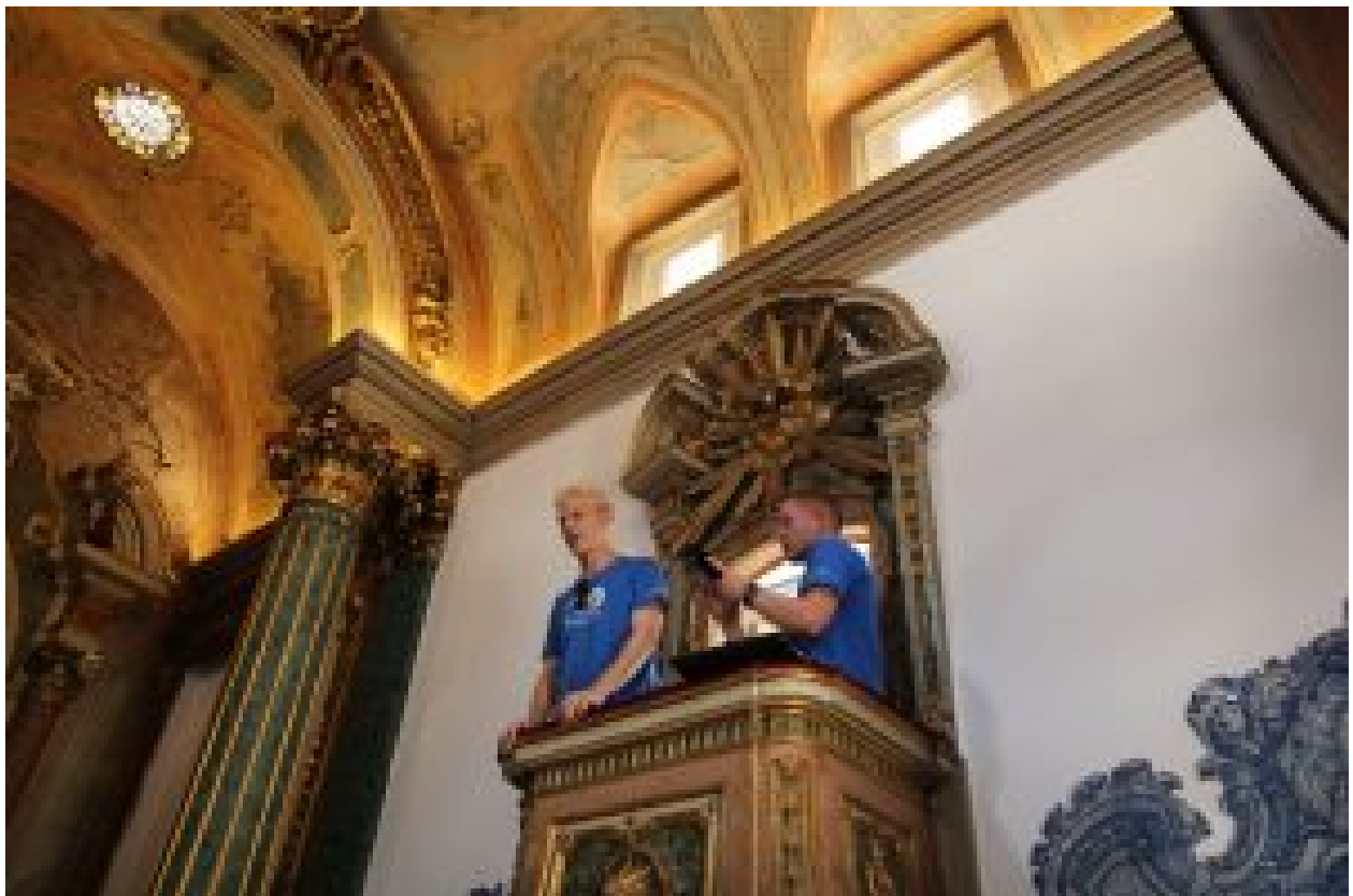
Singing in the chapel of Palacete dos Condes de Monte Real

There is no better way to celebrate the anniversary year of Beethoven's birth than to bring together these two outstanding ensembles. Creating a microcosm of modern society, the BTHVN2020 session will provide a space in which young people can experience for themselves the particular value in embracing diversity, building community and working collaboratively to realise a collective goal. The rehearsal session and concert tour will provide a learning environment and a shared life-changing experience in which deeper cultural understandings can be explored, musical skills can be refined and personal lives can be transformed.