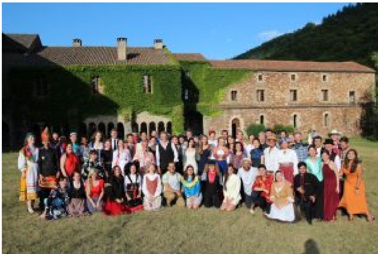
The World Youth Choir singers in traditional clothing, showcasing the cultural richness of their 29 different

Based in Bonn, the National Youth Orchestra of Germany (BJO) is Germany's youngest major orchestra. Founded by the German Music Council (Deutscher Musikrat) in 1969, the BJO is composed of the country's finest young musicians between the ages of 14 and 19. In addition to Sir Simon Rattle, BJO Conductor of Honour since 2018, the orchestra has been directed by renowned conductors such as Herbert von Karajan, Kurt Masur, Gustavo Dudamel and Kirill Petrenko. In 2013 the Berlin Philharmonic Orchestra assumed the role of patron orchestra to the BJO and mentors it through joint rehearsals, masterclasses and concerts.