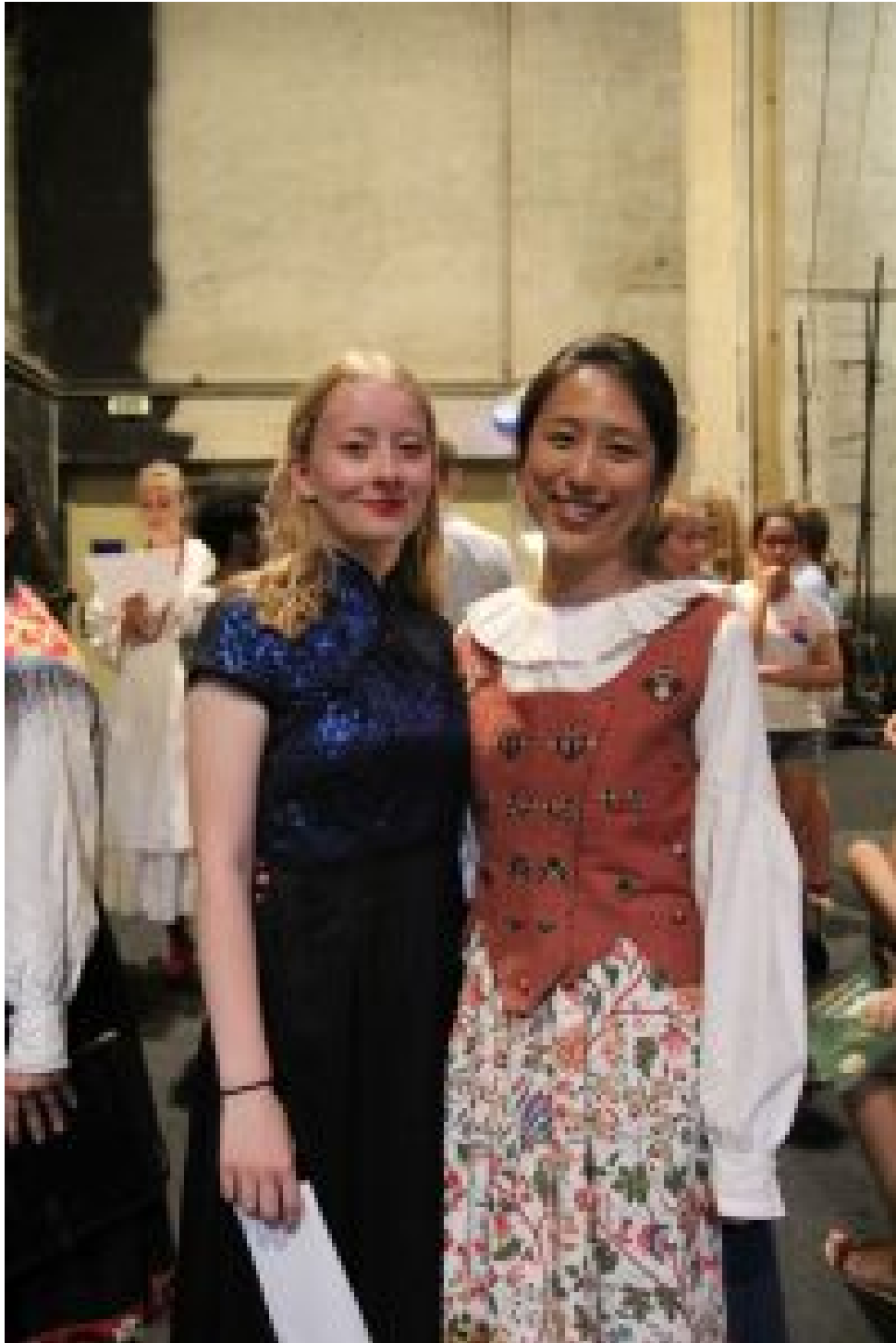
Singers exchange traditional clothing in the backstage of Teatro Nacional de São Carlos (Lisbon, July 31, 2019)